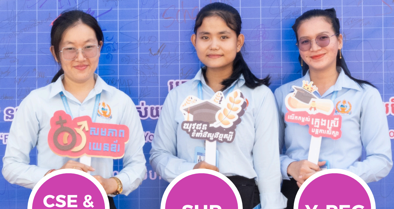
CSE & YH-APP